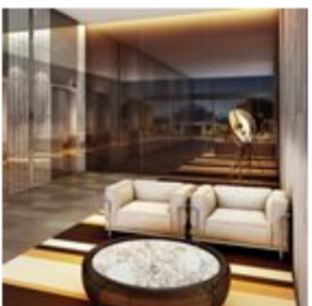
Interiors by Koichi Takada Architects on display at Viva by Crown 0