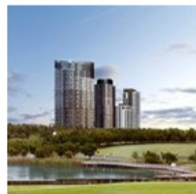
Western Sydney to welcome tallest residential tower 0