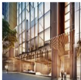
First images of Skye by Crown revealed 1